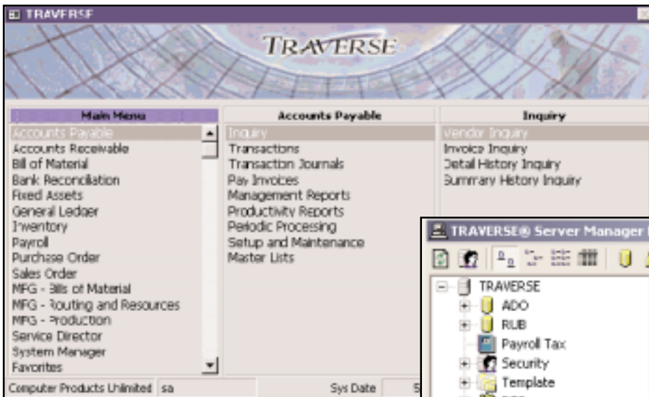
The TRAVSE menu structure